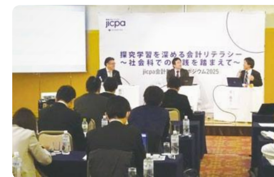
Accounting Education Symposium 2025

JICPA holds accounting education classes presented by CPAs as an initiative to spread accounting literacy to young people, from elementary school students to university students. In the accounting education classes, the CPA lecturers share stories and communicate from their unique position responsible for performing real accounting and auditing work on the importance of the accounting field and their profession in economic activities.